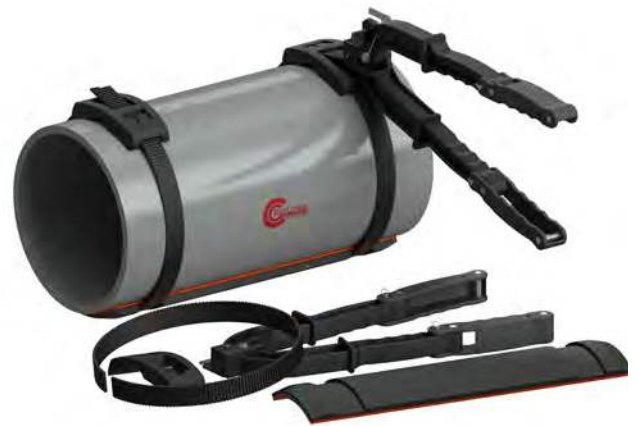
Figure 3. RedLineIPS SmartPad System components.