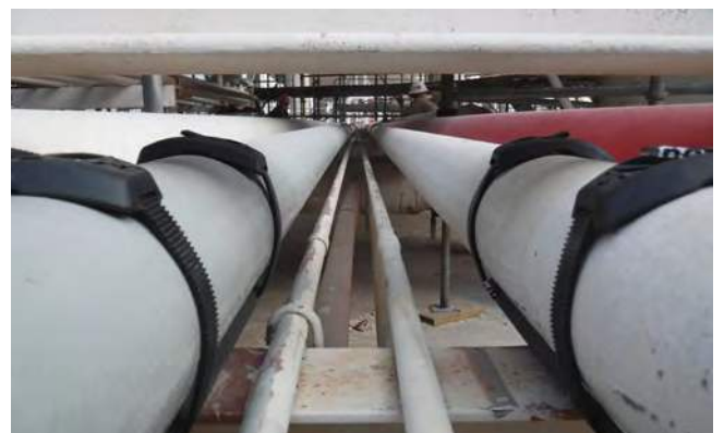
Figure 5. Standard SmartPads installed in a chemical plant in the Gulf of Mexico.