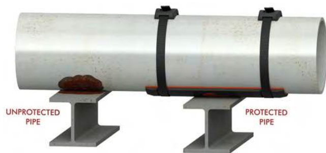
Figure 2. Installed RedLineIPS SmartPad protects piping from external corrosion.

inexpensive visual inspection for corrosion, instead of relying on more expensive inspection methods such as radiography, lasers, X-ray, etc.