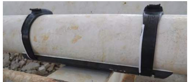
Figure 4. Installed SmartPad with Teflon (white) strips to protect it from highly-corrosive chemicals.