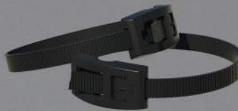
SMARTBANDS & BUCKLES